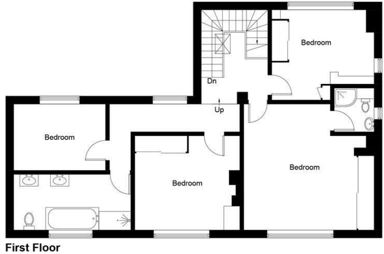
Illustration for identification purposes only, measurements are approximate, not to scale. (ID1242551)